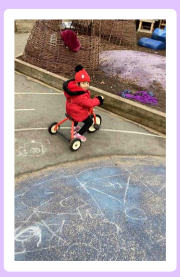
We enjoyed a variety of activities inspired by the story of 'Three Billy Costs Cruff'