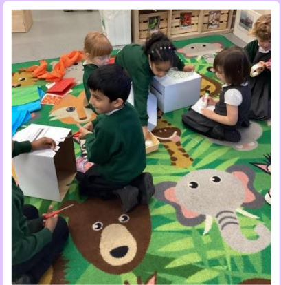
We worked as a team to make dragon heads