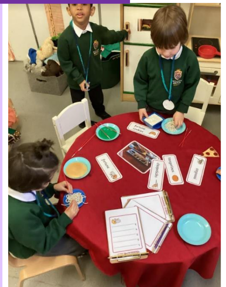
Organising a Lunar New Year celebration party in the home corner