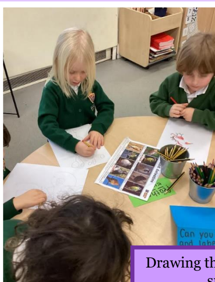
Drawing the birds we have spotted