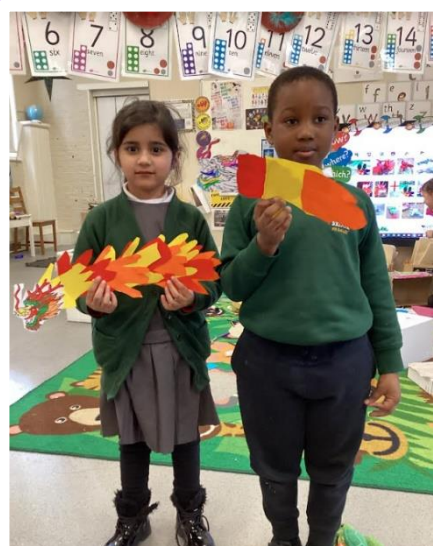
We made dragons to decorate the classroom