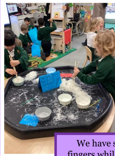
We have strengthened our fingers whilst we persevered to use chopsticks