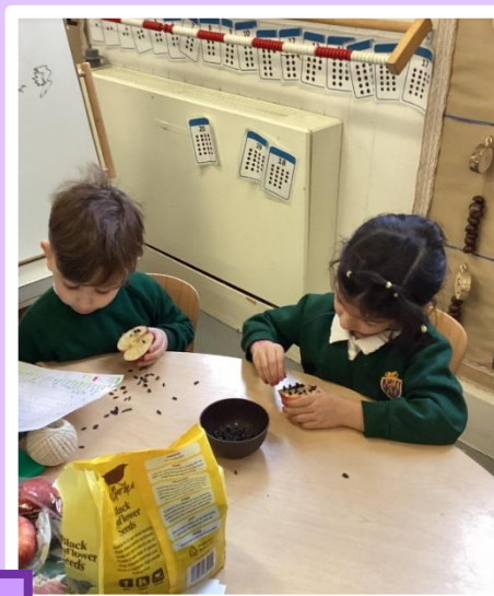
Making binoculars and bird feeders