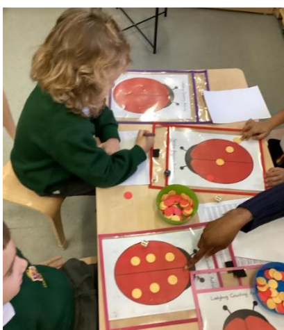
Exploring how to compose numbers to 8