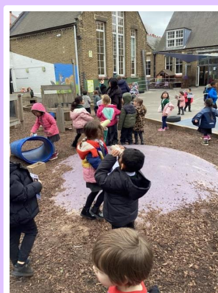
We loved being ornithologists!