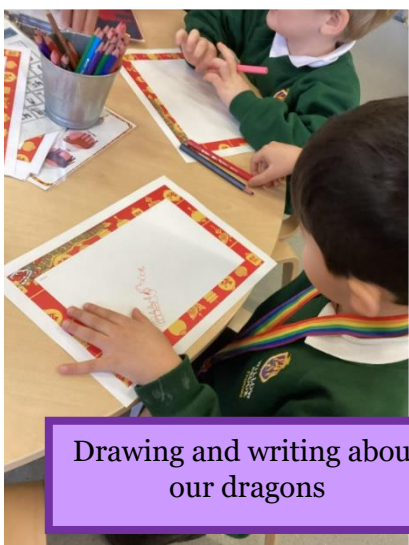
Drawing and writing about our dragons